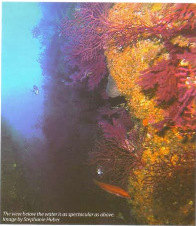
The view below the water is as spectacular as above.