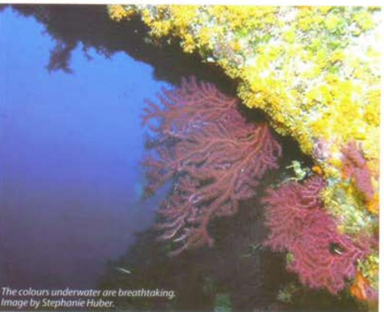
The colours underwater are breathtaking.

either. But perhaps the most striking animal of all, perched on the ledges around the 20m mark, is the odd seahorse. These delicate Syngnathiformes cling perilously to the wispy vegetation with their coiled tails. They are hard to find and it takes a trained eye to spot them but once found they do, without doubt, fascinate the observer with their equine faces moving steadily and slowly as they search for tasty morsels drifting past in the current. Seahorses belong to that elite club of creatures that make every diver's Bucket List and often result in a big bold tick in the logbook – especially since they are also one of the most endangered marine species in the world.