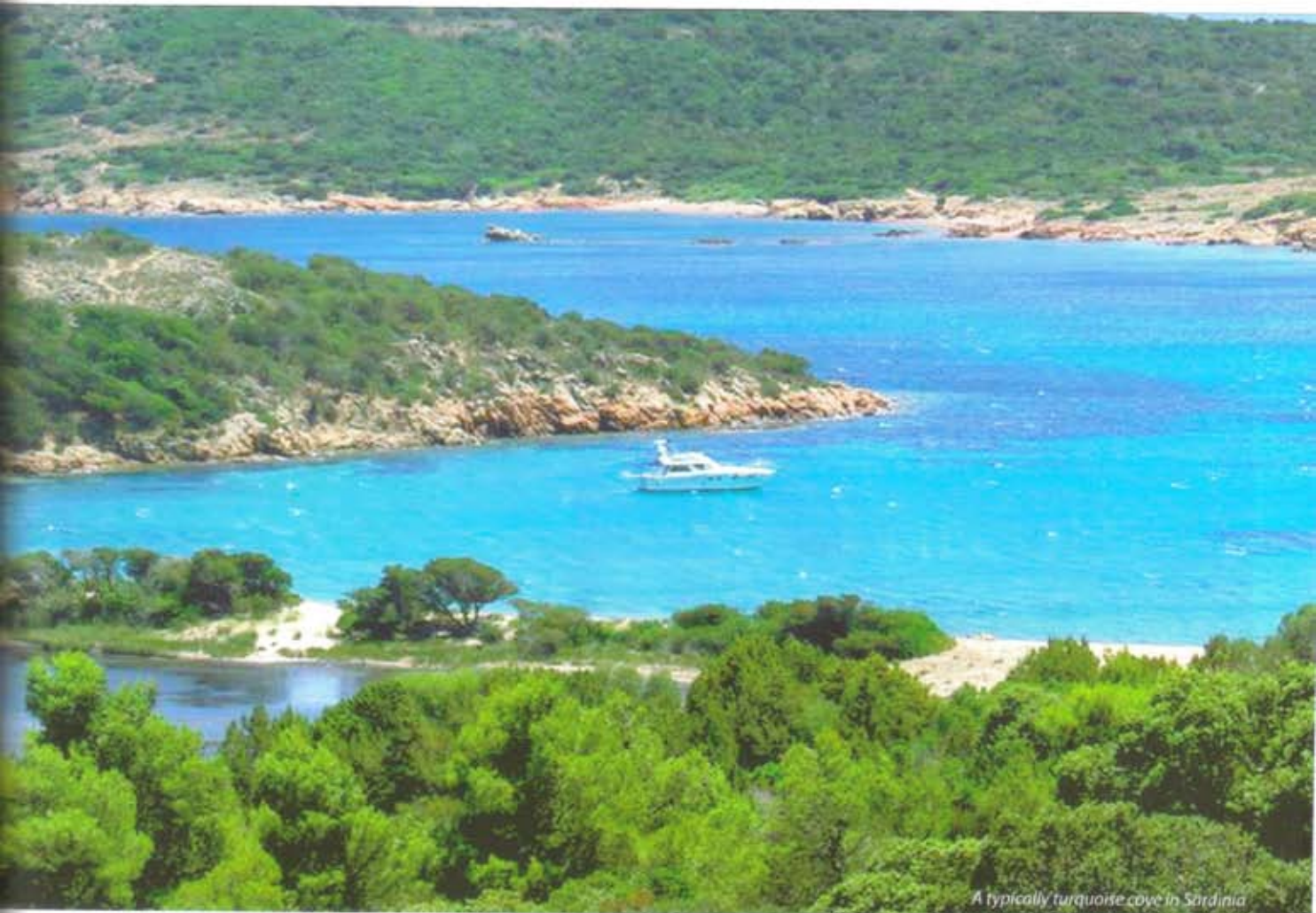
A typically turquoise cove in Sardinia