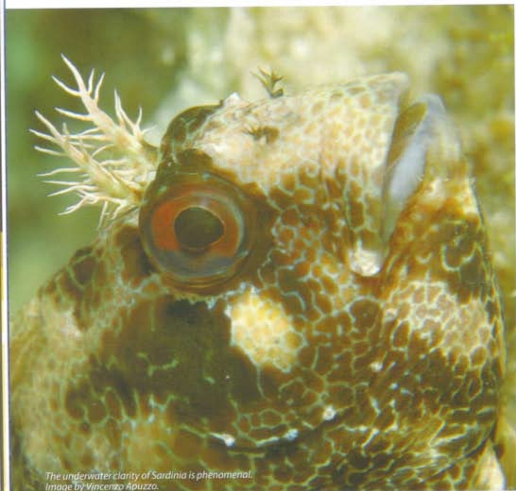
The underwater clarity of Sardinia is phenomenal.