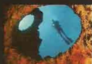
» EXPLORING THE AZORES