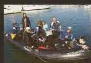
» CLUB TRIP TO THE SOUTH OF FRANCE