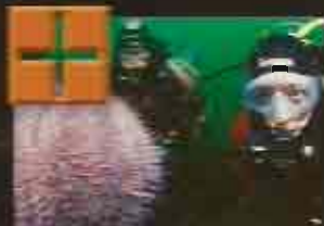
» EARLY SEASON DIVES IN CORNWALL